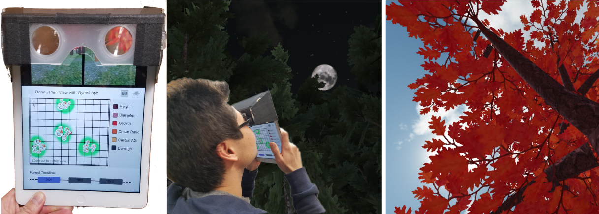
Figure 1: Constructing a low-cost, mobile VR device as shown makes it possible to hold the display up to ones eyes and see a stereoscopic 3D visualization and also interact with a linked complementary 2D visualization displayed on the bottom of the screen.

Computer Science & Engineering University of Minnesota